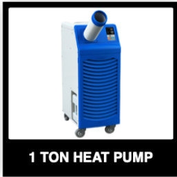
1 TON HEAT PUMP