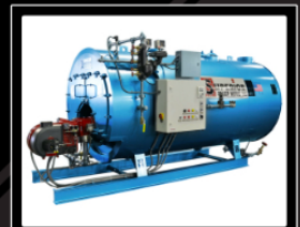
350 HP STEAM